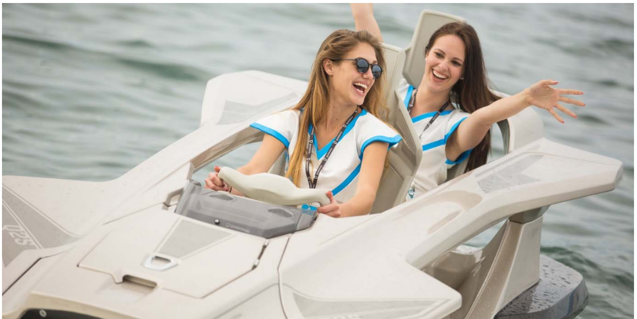
[Quadrofoil Q2S Limited Edition presentation]