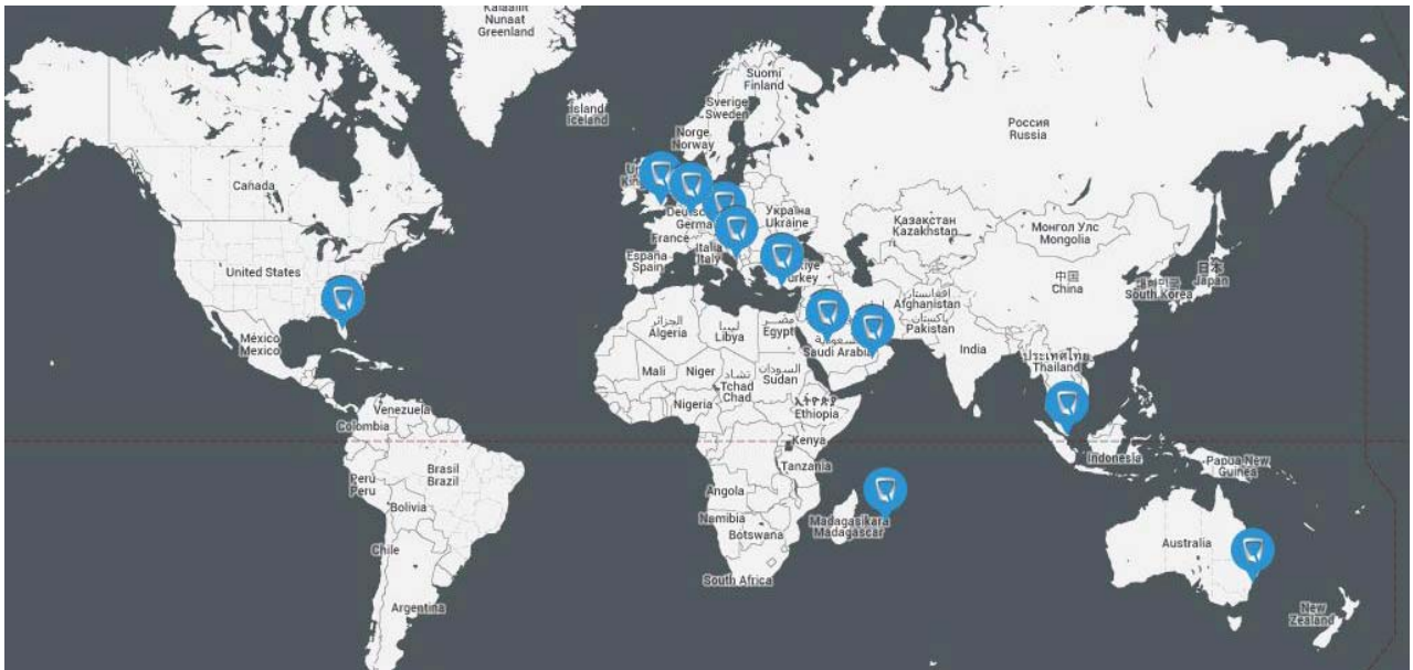
[Quadrofoil Official Dealerships Location]